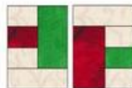
Prime Suspect #1