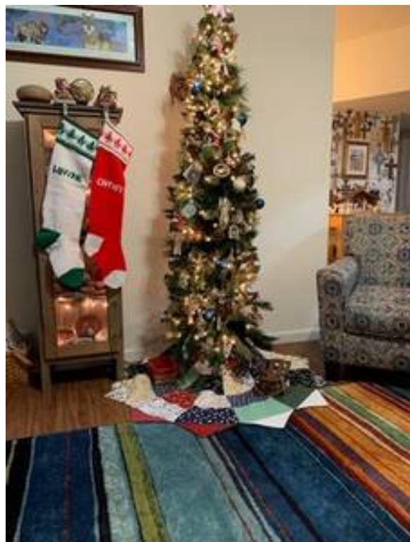
A Christmas Tree Skirt