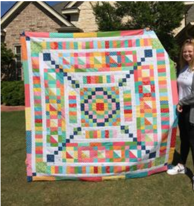
"Sewcial Distancing" Mystery Quilt Top Quilted by Bobbie Collins